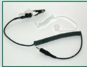
Coil Cord Earphone/Straight Plug (589-5100-059)

589-5100-059 Coil Cord Earphone/ Straight Plug (requires 589-0015-057 speaker mic; not compatible with 589-0015-056)