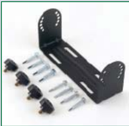
Standard Mounting Bracket (023-9750-012)