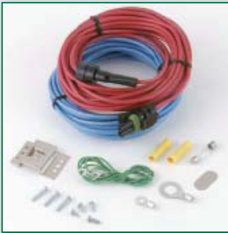
Hardware and 22' DC Cable (023-9750-010)