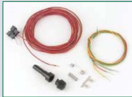
Accessory Wire Kit (023-9750-011)