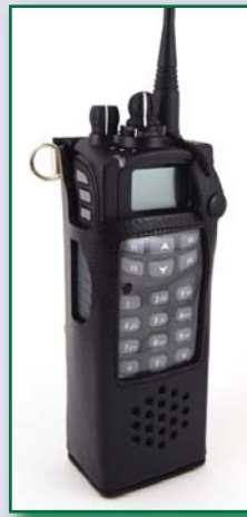
ES Series Leather Case, Model II/III, Belt Flap (585-5100-14003)