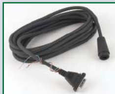
17' Remote Cable or 50' Remote Cable (597-2002-262) (597-2002-263)