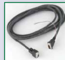
HHC 17' Remote Cable (597-2002-267)