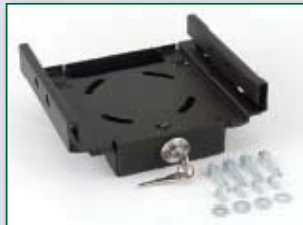
Lockable Mounting Tray (585-7000-185)