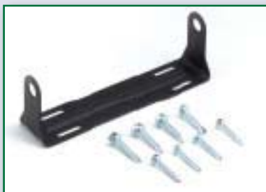
Remote Control Head Mounting Bracket (017-2226-050)