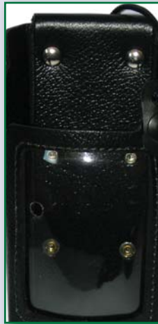
5100 Series 3" Leather Case/D-Swivel Belt Loop (585-5100-122)