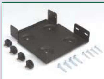
Mounting Bracket for 100W Radio (017-9700-009)

* Call for availability on ES mobile radio