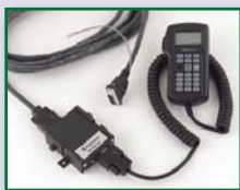
Hand Held Controller (HHC) Kit (250-5300-101)