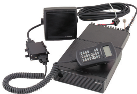
Handheld Controller shown with 5326 100-watt trunk-mount mobile and junction box. External speaker (PN 250-0151-005), also shown, is ordered separately.