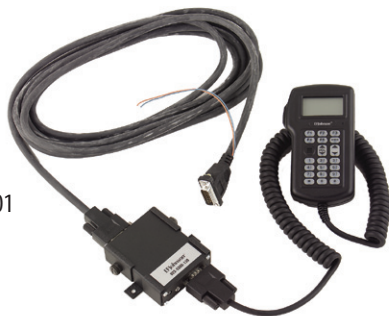
HHC Hit 250-5300-101